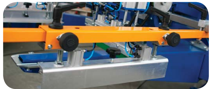
Side Screen Air Clamps

European Technology • Quality Service • Affordable Price