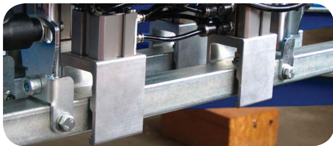
Squeegee & Floodbar Air Clamps