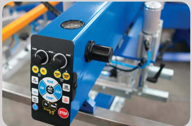
Full Function Printheads