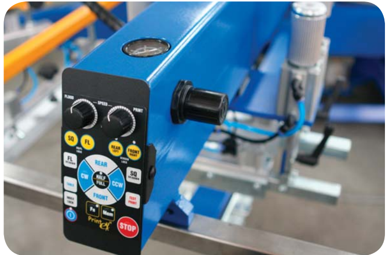
Full Function Printheads

European Technology • Quality Service • Affordable Price