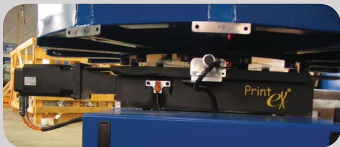
Ultra-Smooth™ Servo Indexer

European Technology • Quality Service • Affordable Price