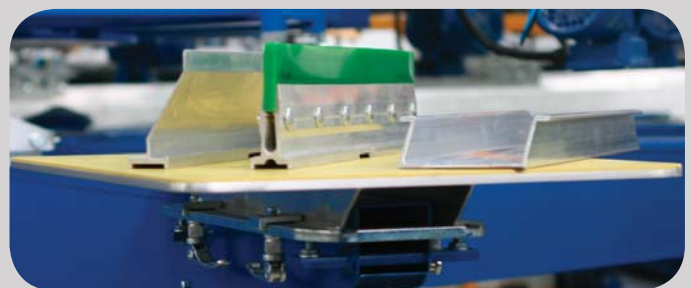
Standard Pallets, Squeegees & Floodbars